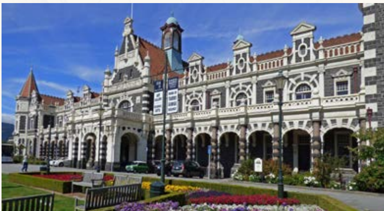
Dunedin Railway Station

Join us on this 10-night, custom-designed itinerary and circumnavigate the South Island of New Zealand to experience inimitable natural wonders that exist nowhere else on Earth. Cruise through the breathtaking scenery of the South Island for seven nights aboard the exclusively chartered, Five-Star LE LAPÉROUSE—featuring only 92 Suites and Staterooms, each with a private balcony, and the extraordinary Blue Eye , the world's first luxury, underwater Observation Lounge. Spend three nights in Auckland including an adventure to the Northland country to learn more about the important national tradition of sheep farming. Experience the genuinely friendly nature of New Zealand “Kiwis” and the rich culture of the indigenous Māori people. Cruise pristine Queen Charlotte Sound and visit the world-famous Marlborough wine region for a specially arranged tasting. Tour charming Christchurch, where English influence persists in Victorian architecture. Choose to extend your journey with our exclusive Pre-Program Option in Sydney, Australia, and Post-Program Option in Mt. Cook and Queenstown, New Zealand.